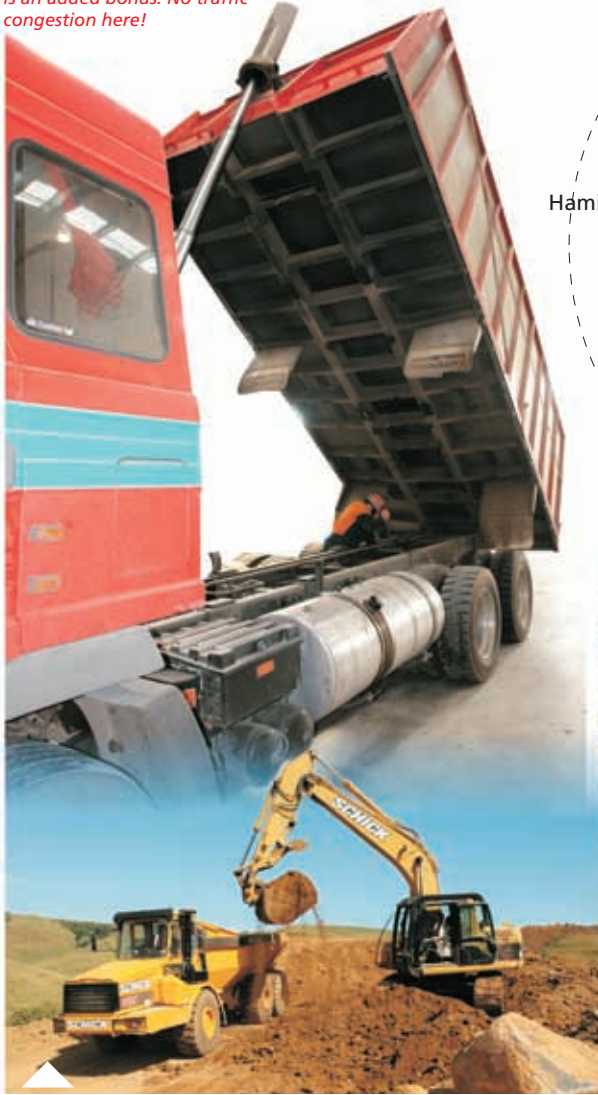
Excavators and bulldozers - MIMICO service and source parts for all brands - from small farm diggers to big earthmoving models.

Truck fleets - MIMICO has the facilities, equipment and expertise to service your fleet. MIMICO's central location in Matamata is an added bonus. No traffic congestion here!