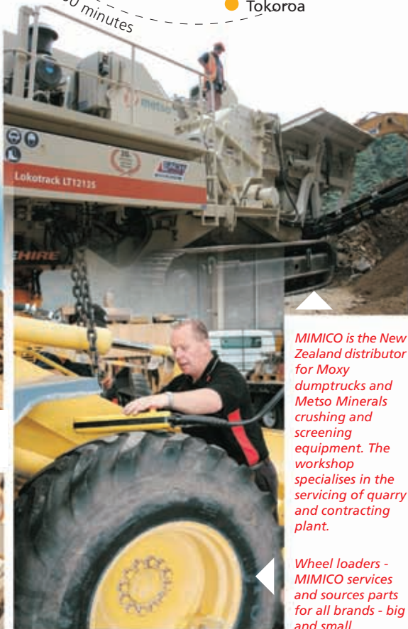
MIMICO is the New Zealand distributor for Moxy dumptrucks and Metso Minerals crushing and screening equipment. The workshop specialises in the servicing of quarry and contracting plant.