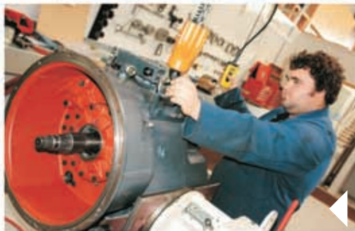
ZF transmissions - MIMICO is a licensed OEM supplier and repairer for all types of ZF transmission. They handle everything from repairs to complete overhauls.